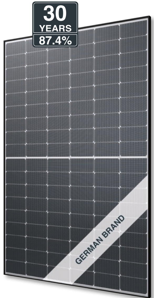
Fig. similar 08TFMEN231116A