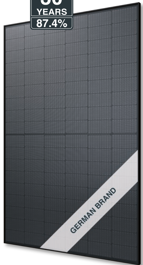
Fig. similar 108TFMEN231213A